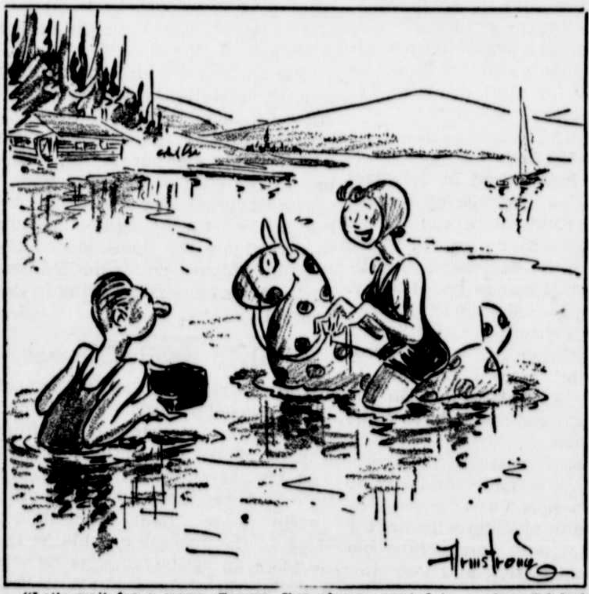
"Let's wait for a wave, George, I've always wanted to see how I'd look on a bucking bronco."