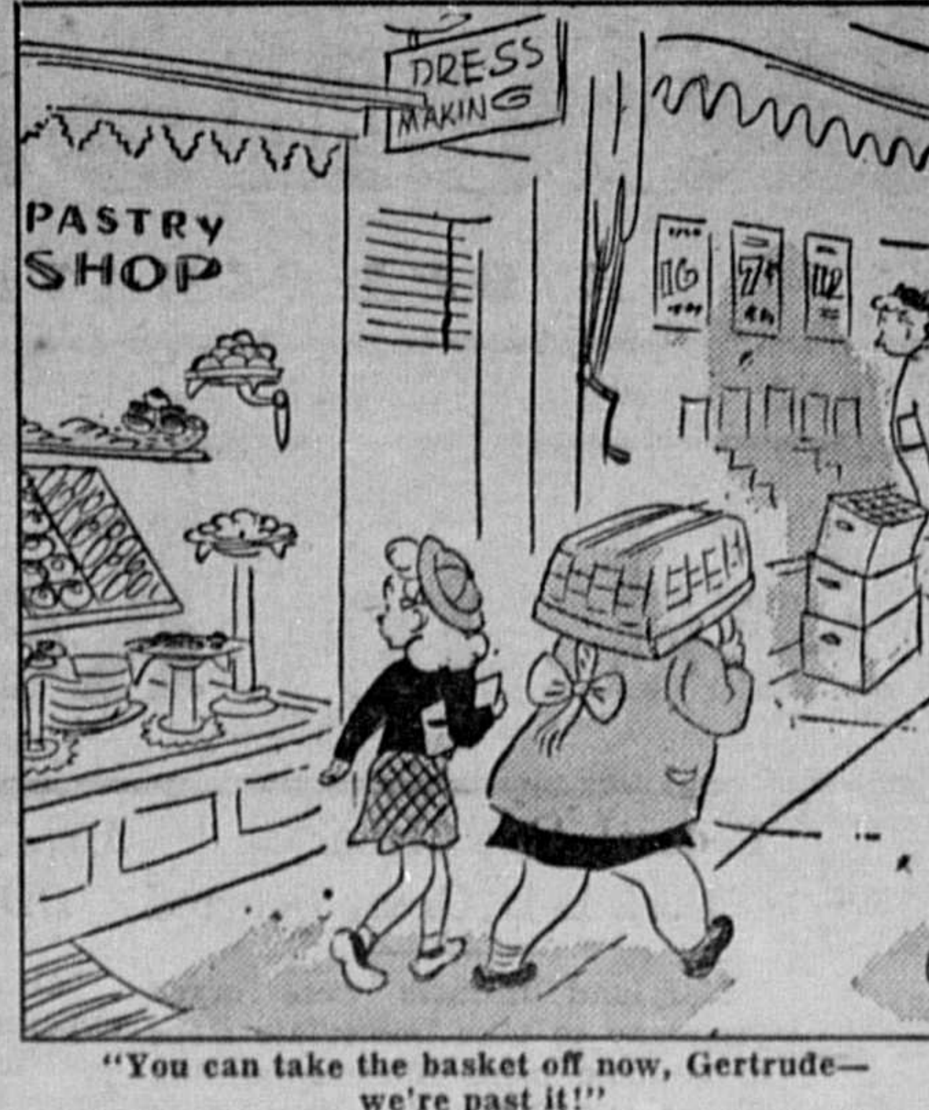
"You can take the basket off now, Gertrude—we're past it!"