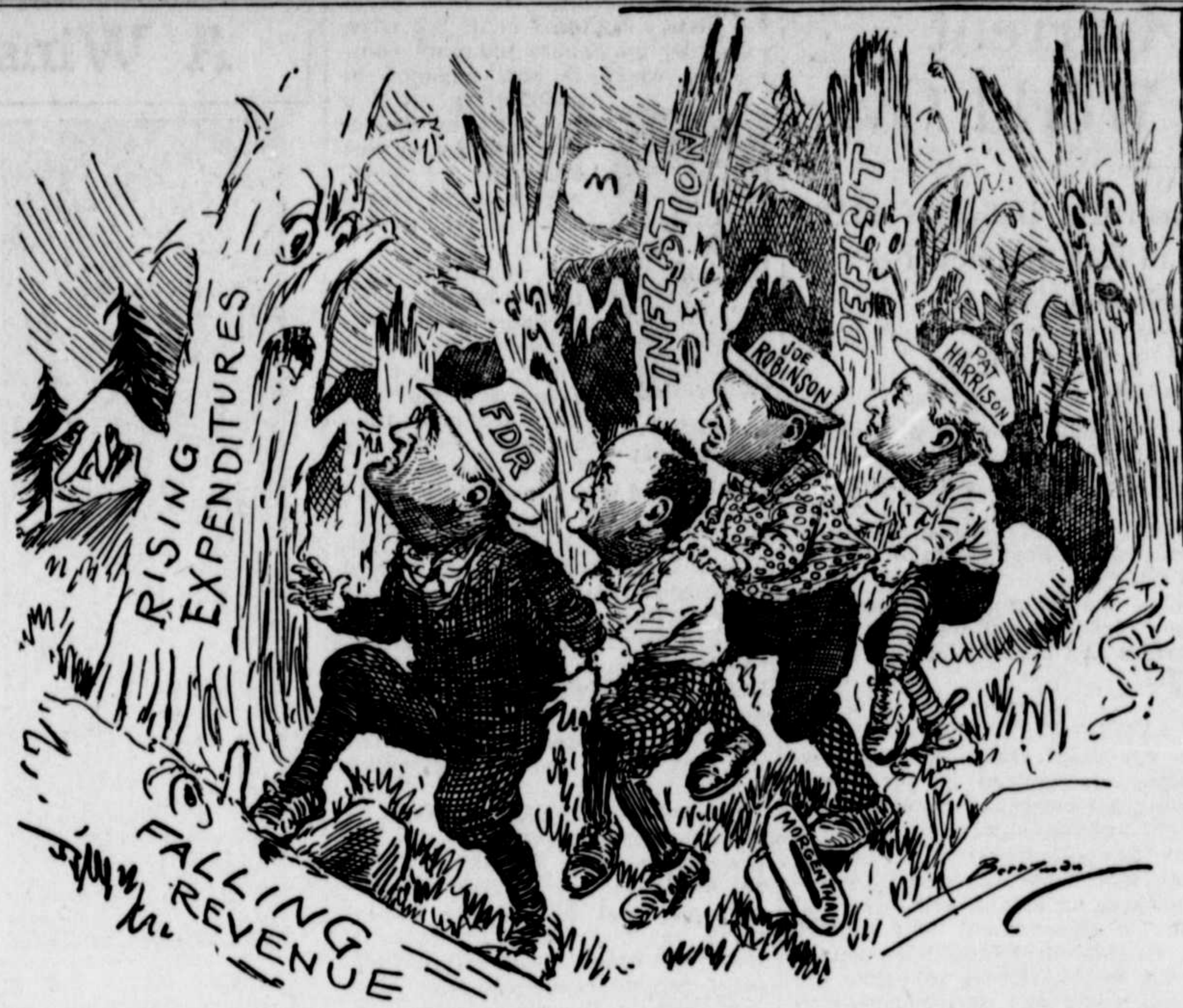
THEY'RE BEGINNING TO SEE THINGS, TOO! —Washington Evening Star