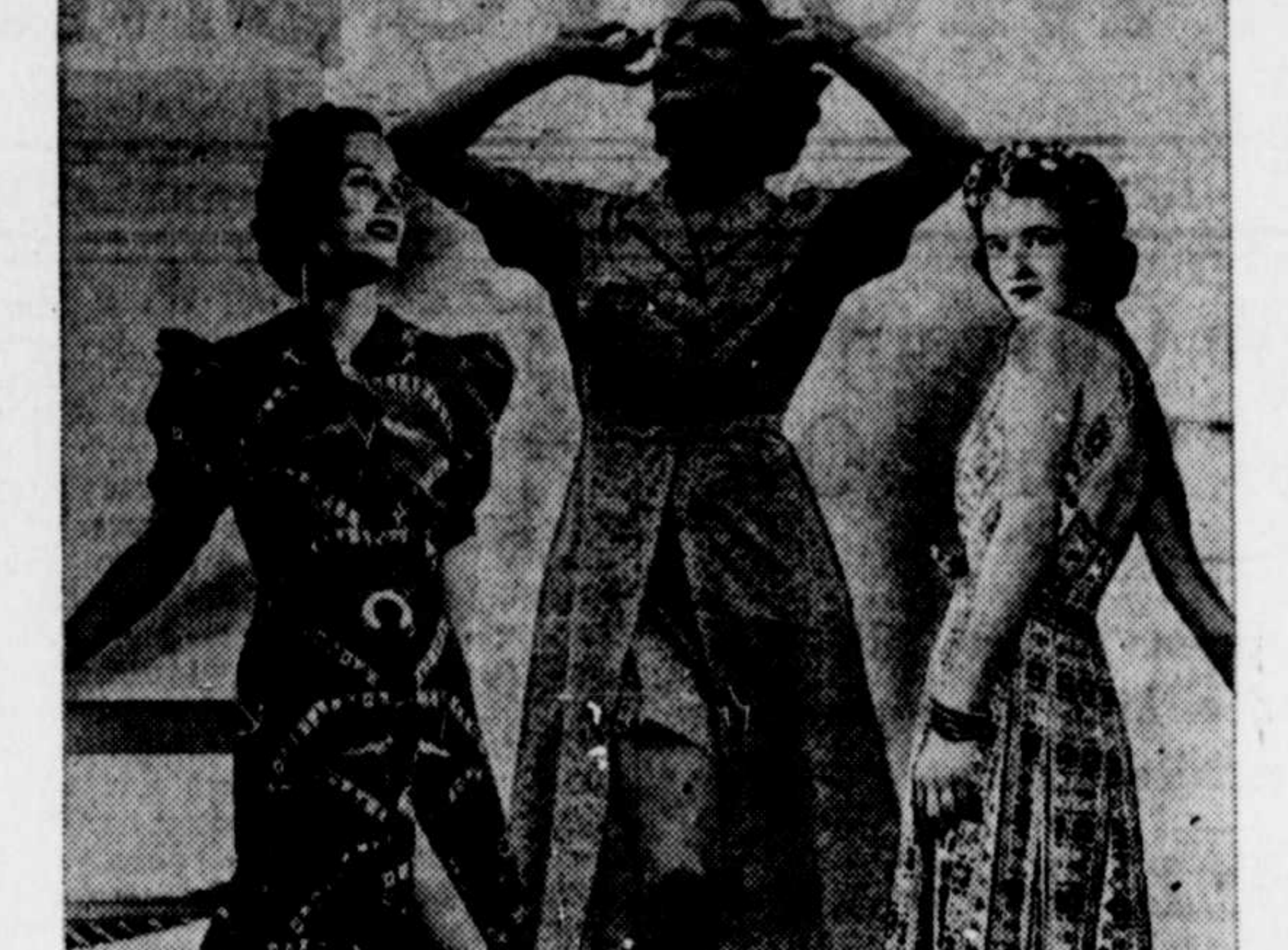
Oh, Oh, Oh! Did you ever see anything in the way of fabric so dazzling to the eye, so daintily designed, so altogether fascinating as the new cotton weaves that are dancing so madly, so merrily, so fashionably into the current style picture?

How perfectly they tune into the costume needs of carefree summertime activities! It is no wild statement to say that an entire wardrobe can be successfully fashioned of cotton materials that will carry smartly through active sports and morning dress hours, that will answer to the call for voguish afternoon costumes, climaxing the around-the-clock program with evening formals that are just too lovely for words.