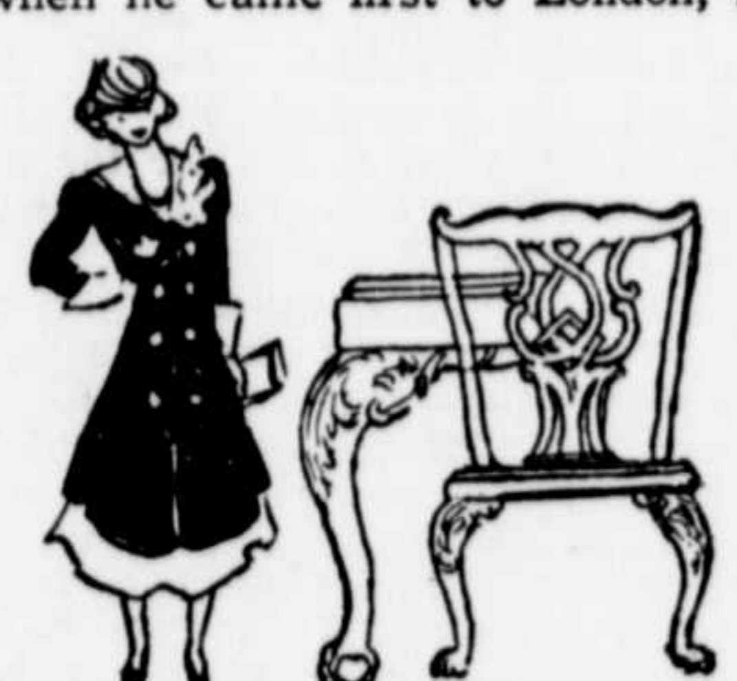
Learn About Chippendale Chairs.

Chippendale was certainly the most versatile and prolific of furniture makers, and his designs have a distinguishing individuality about them that survives generations of copyists. The first important worker in mahogany, a new wood when he came first to London, he