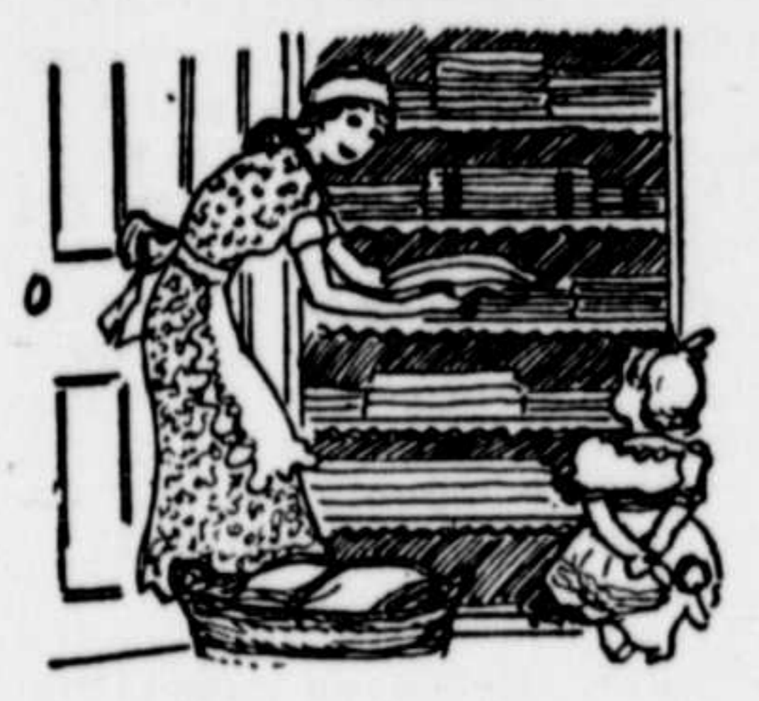
Your Linen Closet Tells on You.

Speaking of sheets, here are the things we think are important to know about them: Short sheets are a constant nuisance. Get 108-inch length sheets in order to have the right amount of tuck-in. And about length, "torn" size means the length without shrinkage or hemming. Actually a 108-inch torn size means about a 98-inch length. This applies to the average sheet. One mill now offers