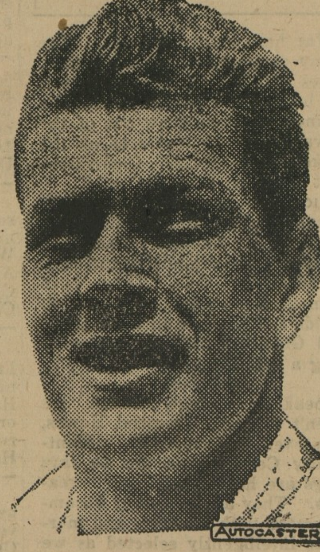
A new close-up of champion Gene Tunney—taken as he arrived in Chicago to finish training for the battle in defense of his crown against the former champ, Jack Dempsey, on September 22.

The prosecuting attorney was having a difficult time with the star witness for the defense. His answers were evasive and not to the point. The judge finally cautioned him to give more precise answers.