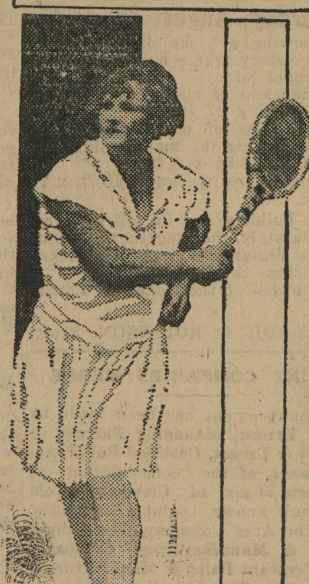
Another Helen from Berkeley, Calif.—this one Helen Jacobs, who is this year causing a stir in Eastern net circles. In the Manchester Mass., finals she was defeated by champion Helen Wills—but she showed great promise for seasons to come.

Don't go around with a man's wife unless you can go ten rounds with him.