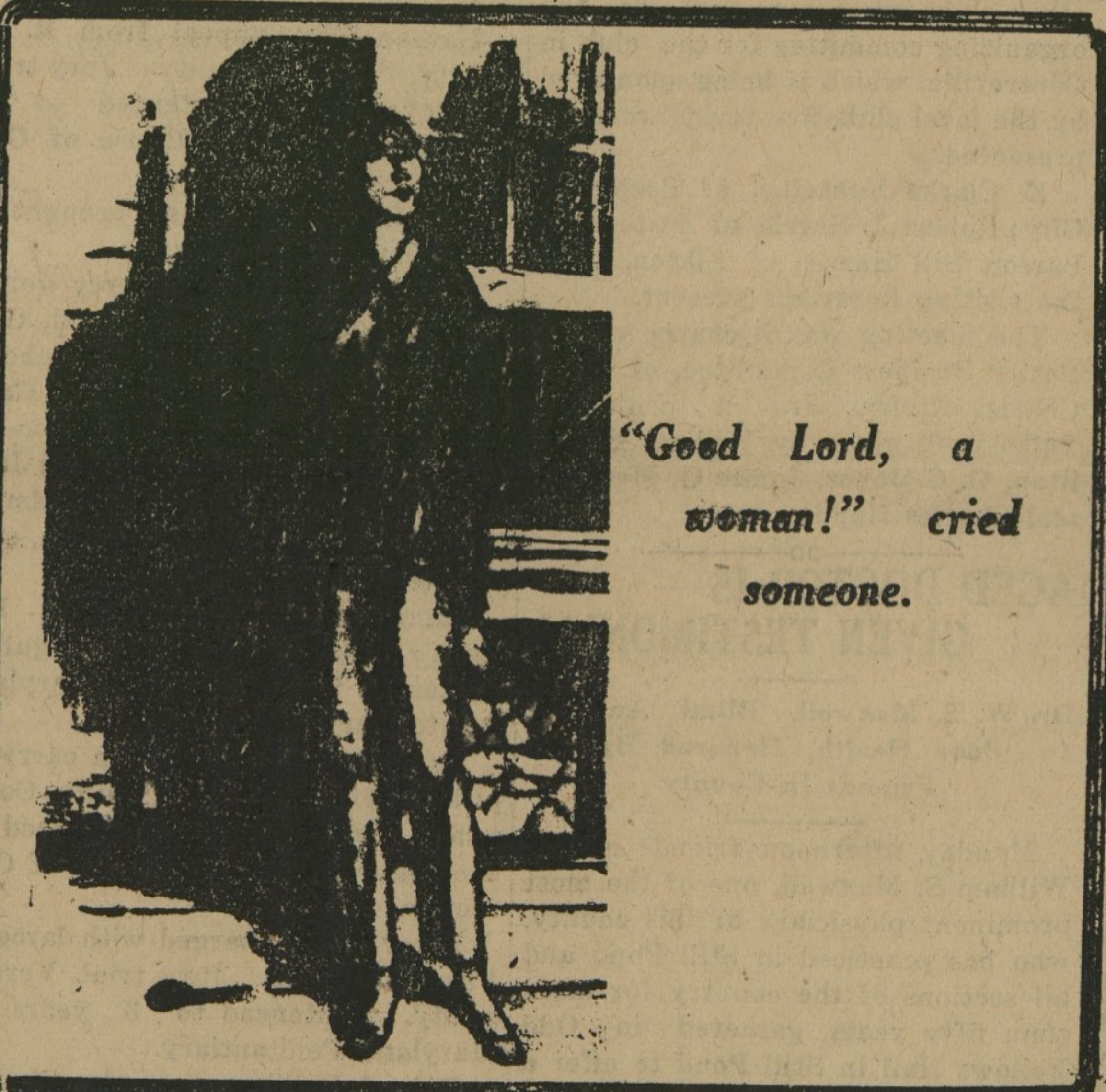
"Good Lord, a woman!" cried someone.

"Our business in Richmond is done. You have all been of great assistance to me; but I have this day myself discovered the things we sought. I know the number of men, arms, rounds of ammunition and food supplies. In other words, we now have our fingers on the pulse of the enemy; we can feel it growing feebler and feebler. I shall no longer be your chief after tonight shrdler be your chief after tonight. We shall each of us go on our own again. We leave tonight. The horses are ready at Moriarty's stables, three blocks away. We ride west first. Then we turn toward Maryland. No main sikes until we are near the boundary. In the sealed envelope I have just given each of you are facts and information. Some one of us will