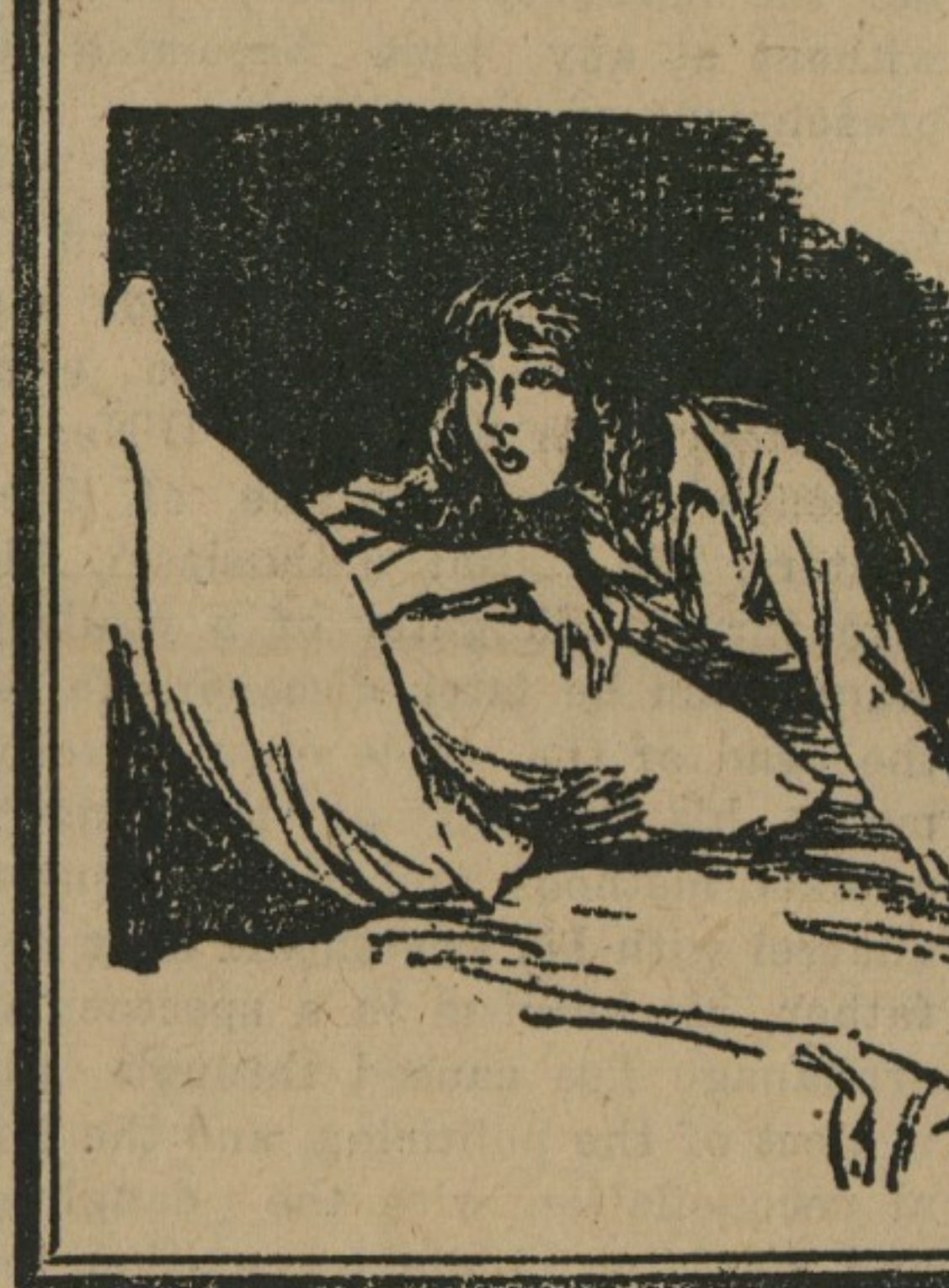
Presently the girl on the bed sighed, turned and awoke.

had trampled her pride in dust, mocked her; so would she trample upon their honor and mock them.