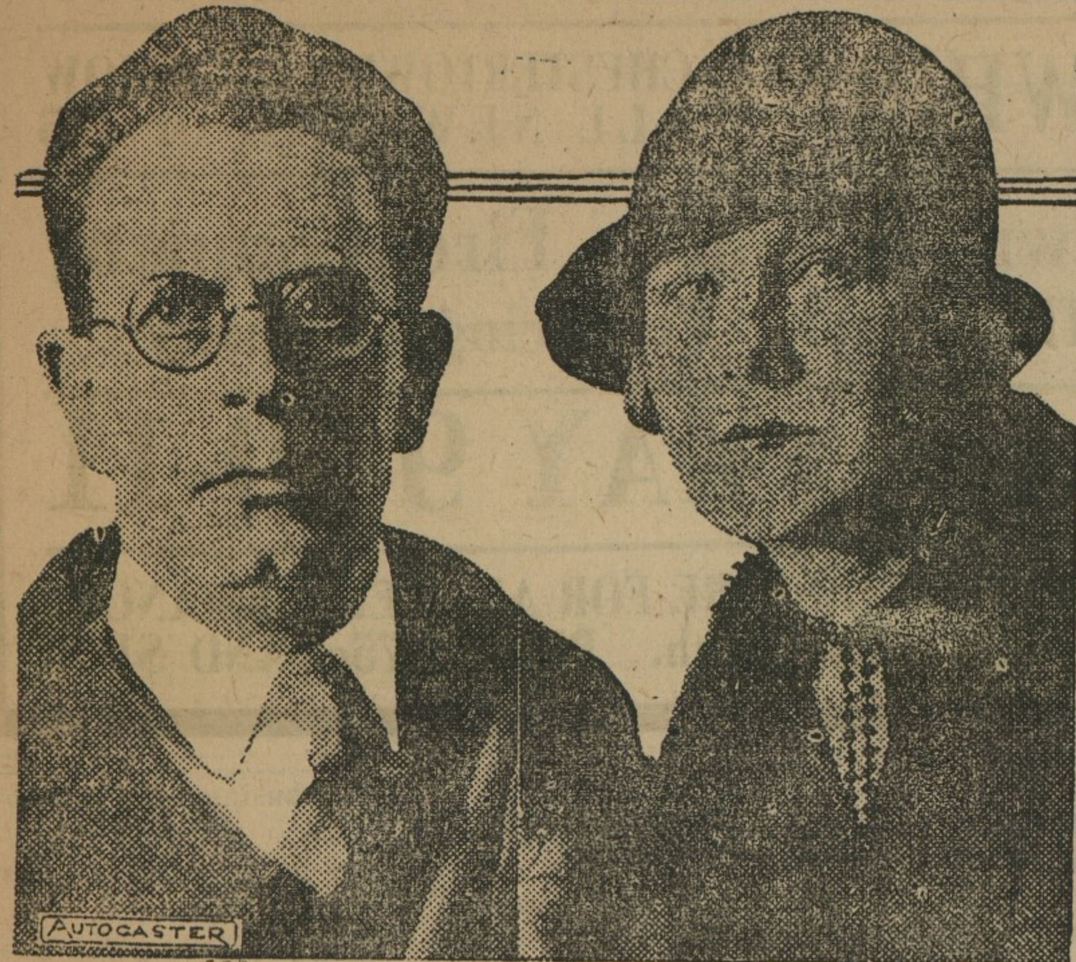
This pair Henry Judd Gray and Mrs. Ruth Brown Snyder, charged with the brutal murder—by beating, chloroform and strangling of Albert Snyder, partially deaf husband of the woman, as he slept in a drunken stupor, now face a jury in New York in a case which holds the attention of the nation. The motive, it is charged, was lust for gold—Snyder's insurance,—and undisturbed love. Both have children.