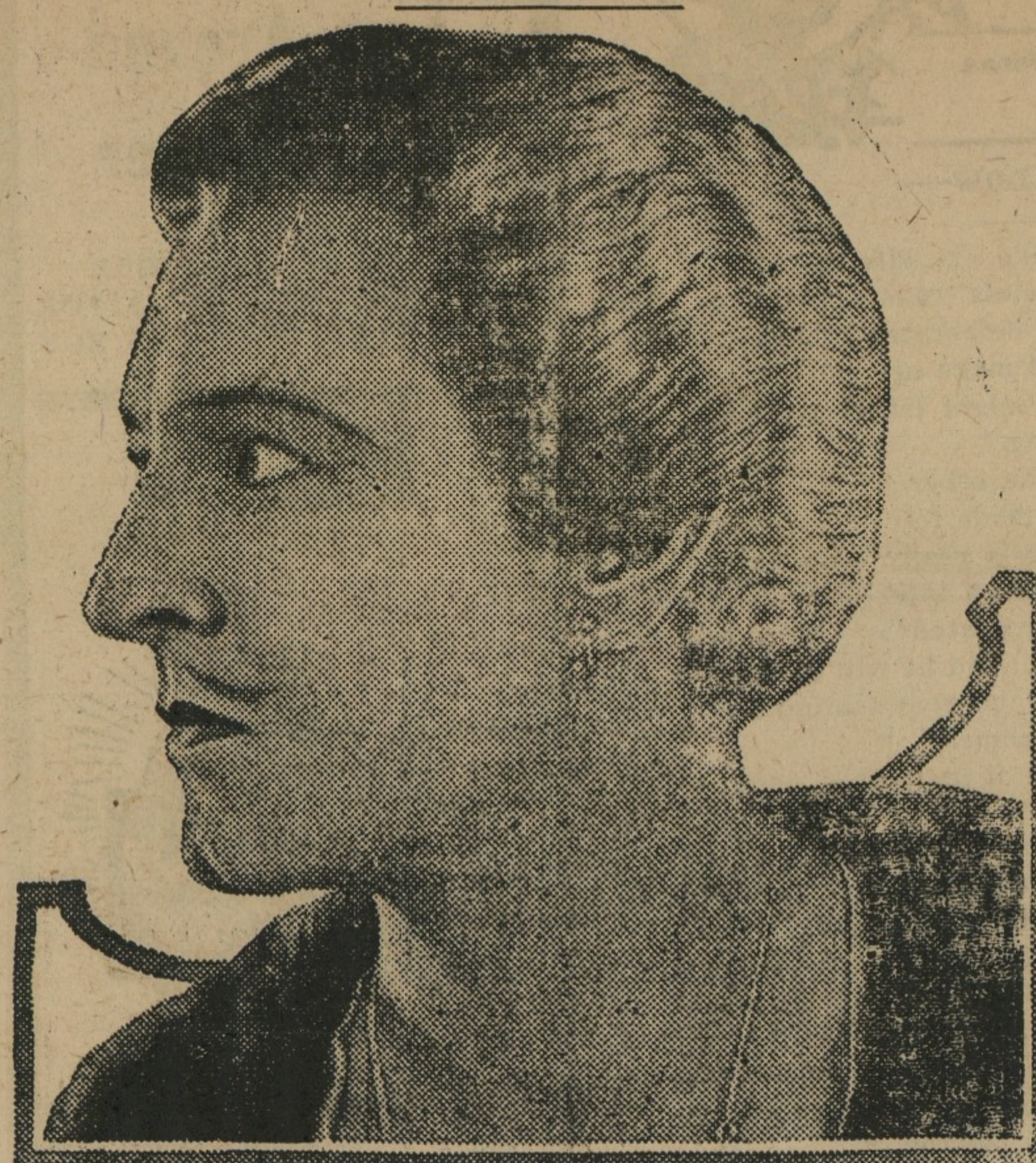
JOHN BARRYMORE in "DON JUAN" - A Warner Picture