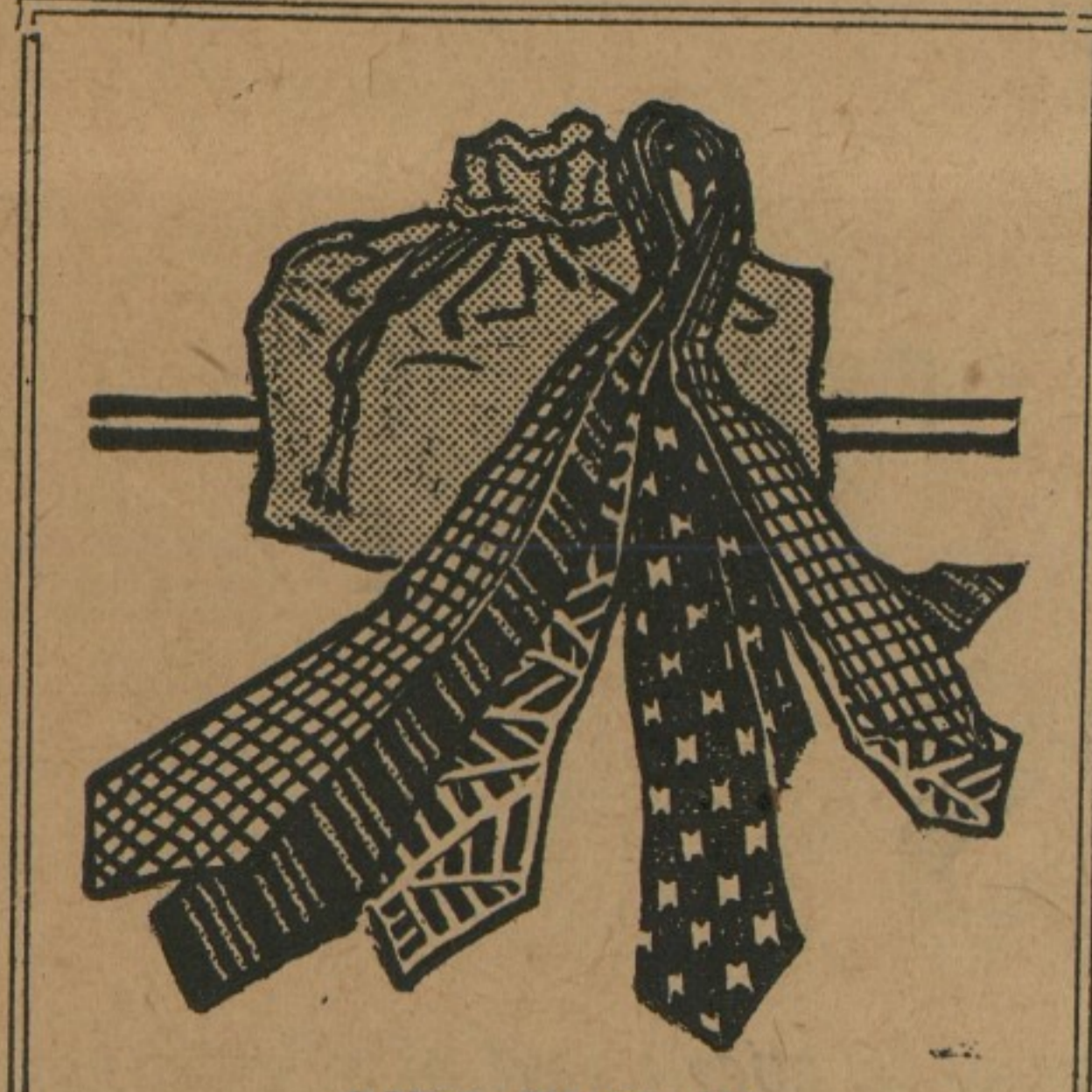
GIFT TIES IN CHEERFUL HOLIDAY COLORS

GIVE HIM A GIFT CERTIFICATE when you can't decide When you want to be absolutely sure of pleasing a man of rather difficult tastes, a gift certificate with a good store's name is just the thing