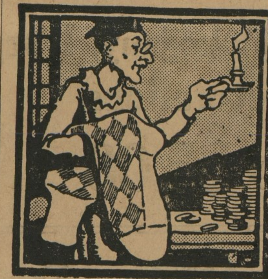
INTERWOVEN WOOL HOSE they're great savers