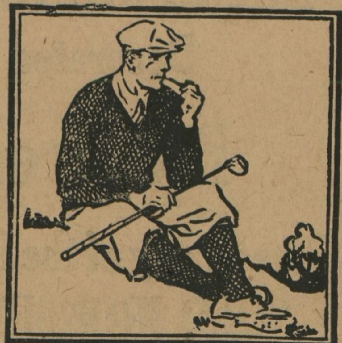
CREW NECK SWEATERS FOR COLLEGE MEN $6.50 to $8.50

Broadcloth shirts, collars attached or detached; 2 1/2 to 3 inch points. Soft fine fabrics; rich colors; interesting patterns.