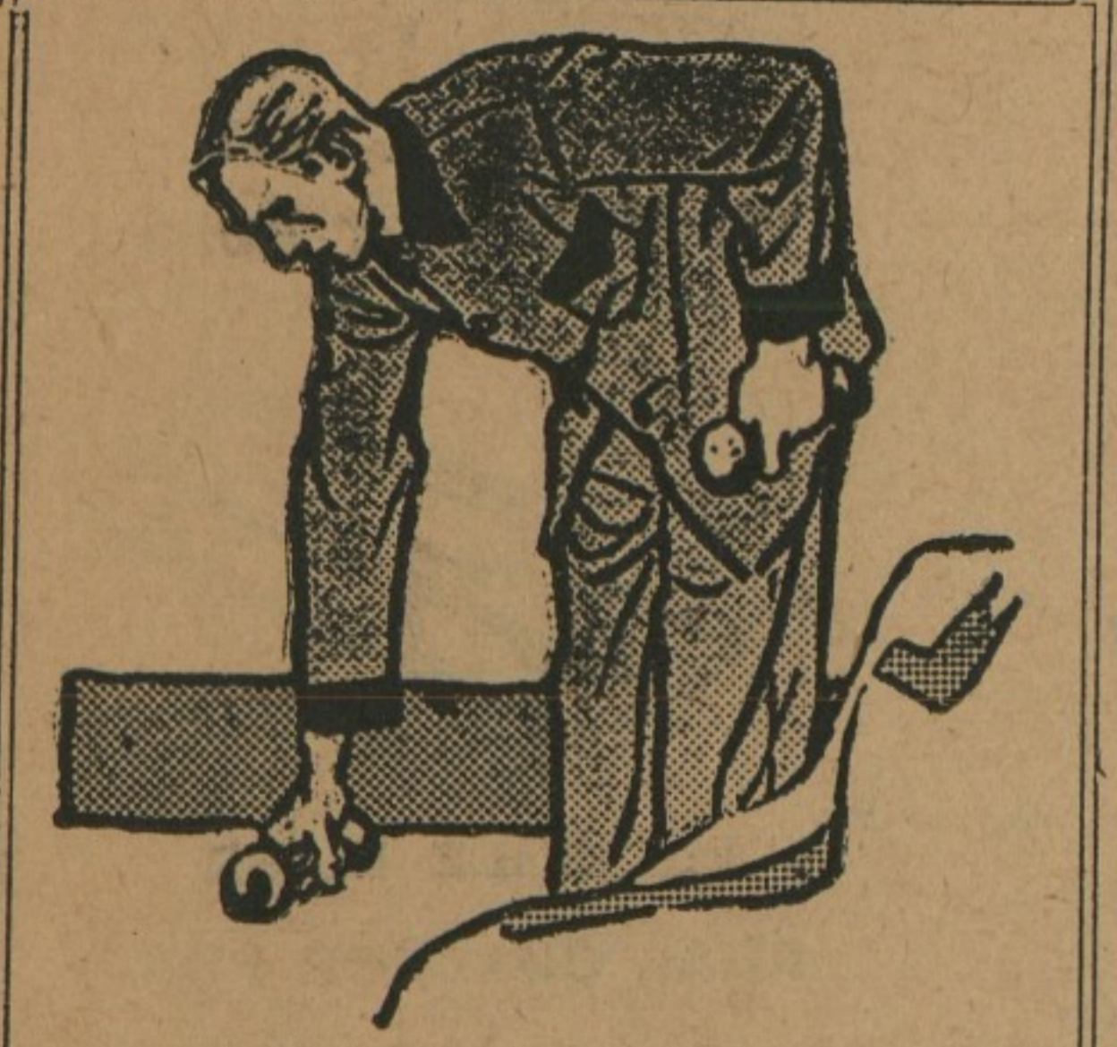
LOTS OF COLOR IN THE NEW PAJAMAS $1.50 to $5.00

make a good homecoming gift They're yellow washable calfskin or pigskin, hand sewn, harness stitched to prevent ripping—the kind that are enriched by wear.