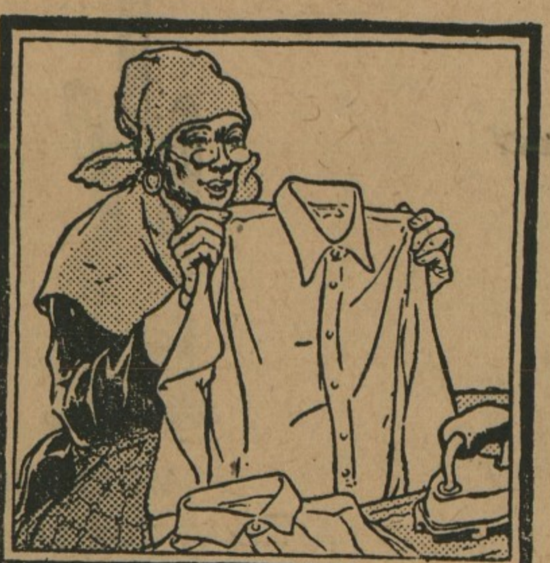
TO ANYBODY WHO KNOWS SHIRT VALUE Here's something to talk about at

Striking combinations of pastel colors—soft materials that launder like a fine linen handkerchief—coat and pull over styles with comfort in every line—prices that couldn't crowd in more value.