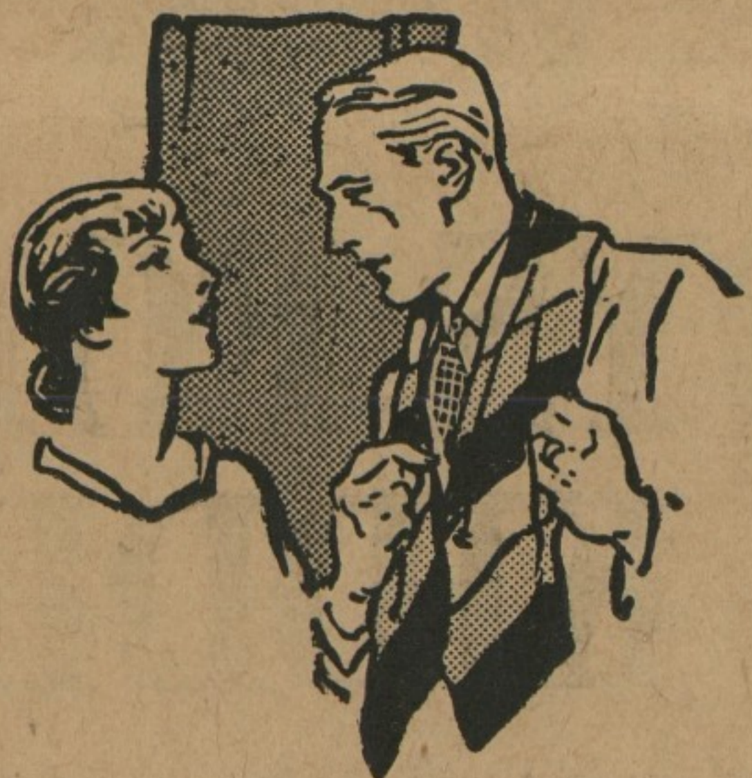
LUXURIOUS SILK MUFFLERS

Every sparkling color you could want is here—every attractive new pattern, too—and quality that does extra time when it comes to wear.