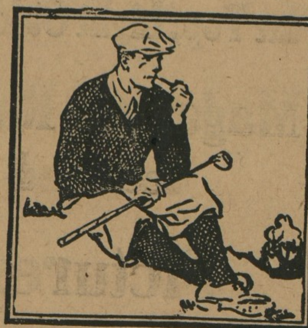
CREW NECK SWEATERS FOR COLLEGE MEN

Broadcloth shirts, collars attached or detached; 2 1/2 to 3 inch points. Soft fine fabrics; rich colors; interesting patterns.