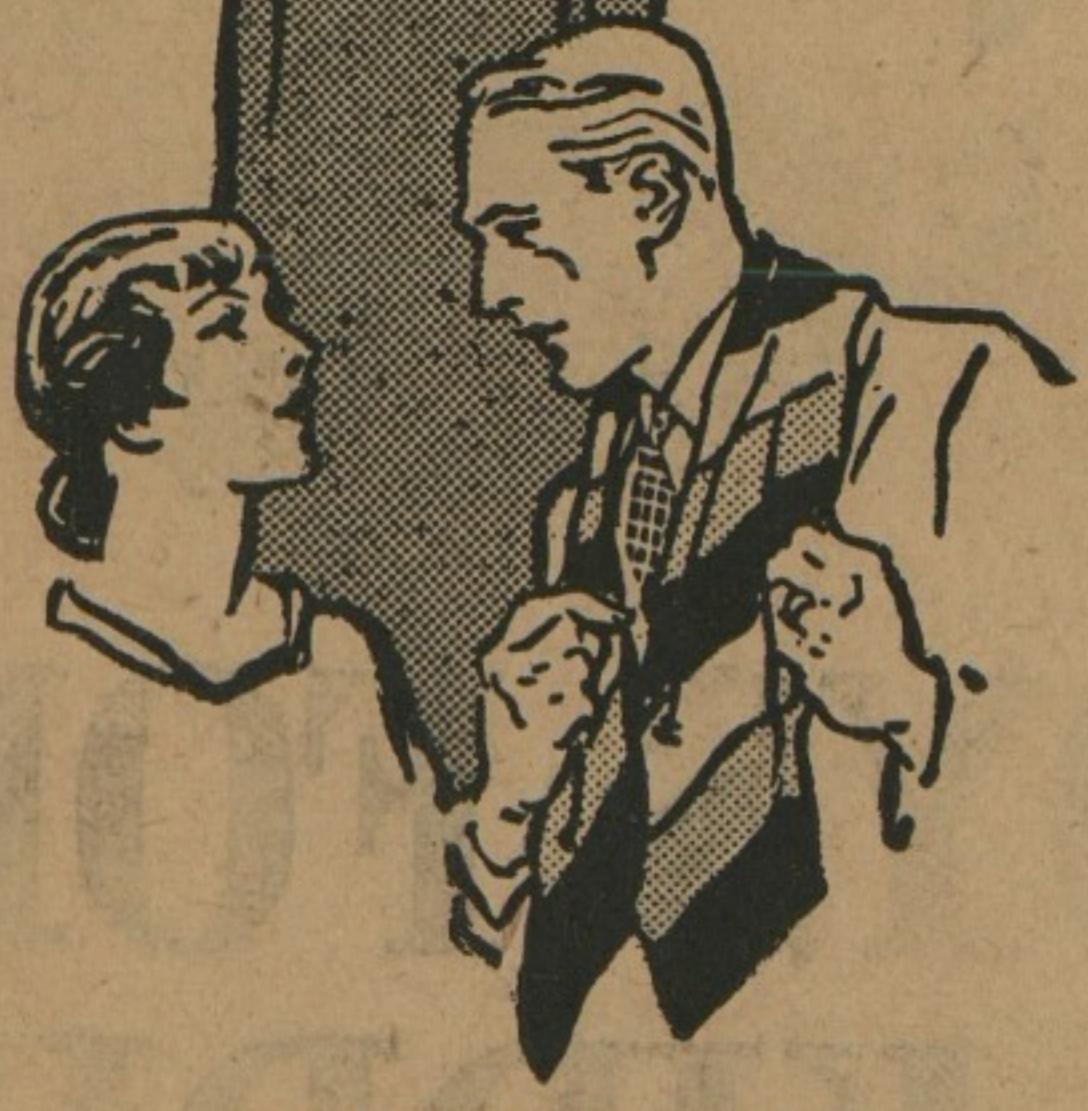
LUXURIOUS SILK MUFFLERS

Every sparkling color you could want is here—every attractive new pattern, too—and quality that does extra time when it comes to wear.