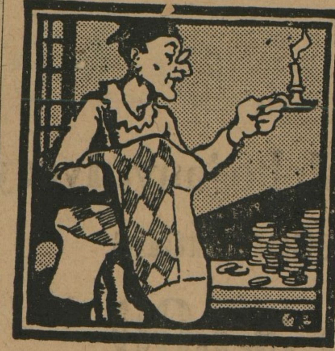
INTERWOVEN WOOL HOSE

When you want to be absolutely sure of pleasing a man of rather difficult tastes, a gift certificate with a good store's name is just the thing