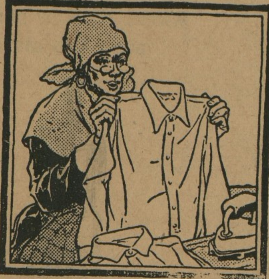
TO ANYBODY WHO KNOWS SHIRT VALUE

Striking combinations of pastel colors—soft materials that launder like a fine linen handkerchief—coat and pull over styles with comfort in every line—prices that couldn't crowd in more value.