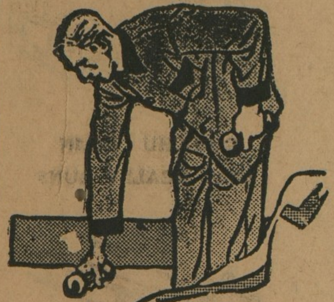
LOTS OF COLOR IN THE NEW PAJAMAS

make a good homecoming gift They're yellow washable calfskin or pigskin, hand sewn, harness stitched to prevent ripping—the kind that are enriched by wear.