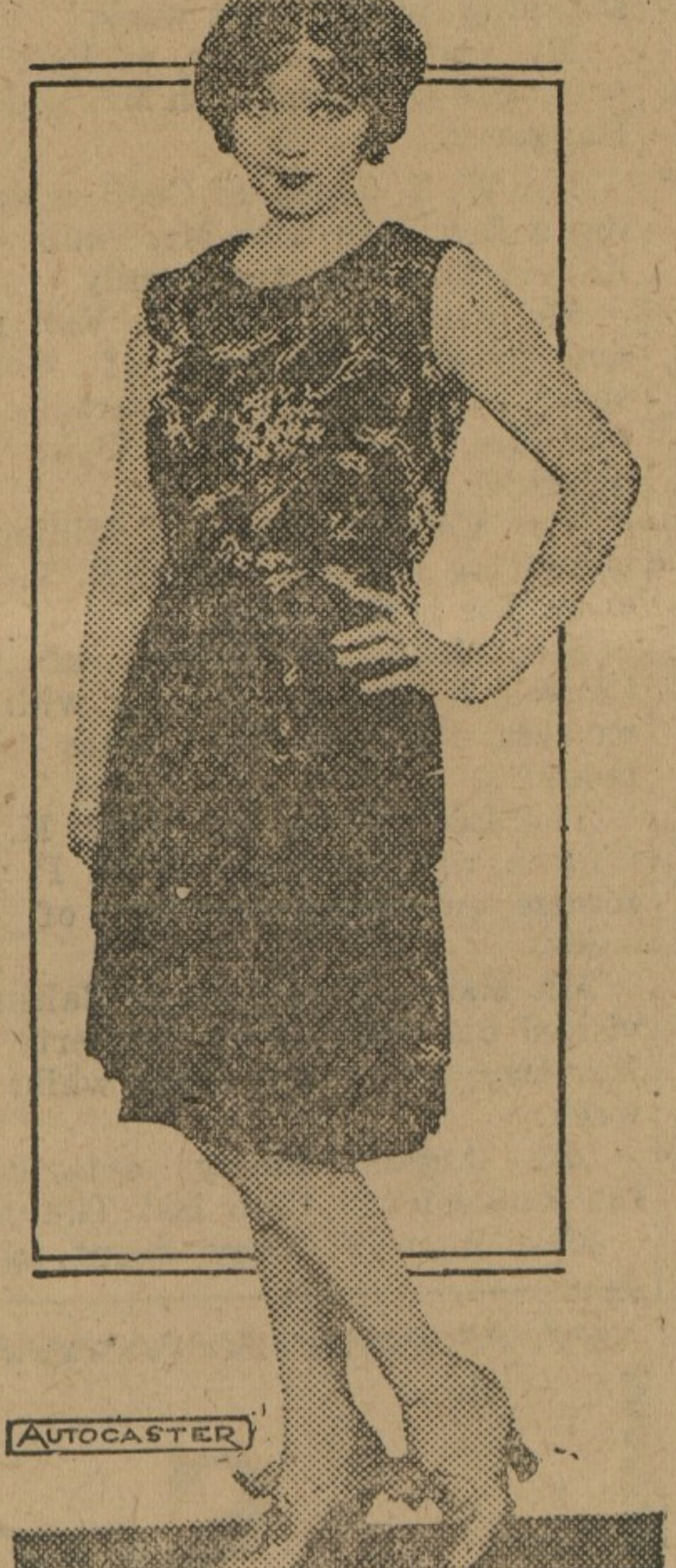
A most appropriate frock for the holiday festivities. Fashioned along decidedly feminine lines of velvet and georgette, and gaily embroidered in white. The skirt, which is flared, has three tiers of black velvet. The round neck is smartly finished with a fold of black velvet.

parent and silk chiffon velvets are extremely popular. These are usually simply made with a slight flare and deep decollete neckline as the outstanding feature. Exquisitely beaded crepes, reminding one of precious jewels as they scintillate in the brilliant lights on the dance floor, are also very smart and popular. Satins, laces and metal brocades are all very intriguing, too, especially when fashioned in the new flare effects. The evening gown is not complete without the consideration of an accompanying pair of slippers. Each individual gown needs a distinct type of slipper. Gold and silver kidskin lead the evening footwear mode, for they are both chic and practical. Often a gold slipper will be smartly trimmed in silver kid or vice versa. Sometimes the two are woven in a checked effect. Brocades and colored satins are also worn. But the gem of all is a dainty model in gold kidskin with artistic blue forget-me-nots embossed upon the vamps and bordering the side.